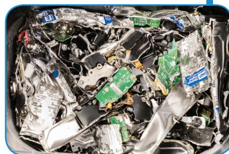
Particles fall into the waste bin for easy storage and disposal