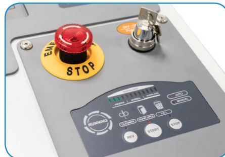
LED control panel, safety key lock and large emergency stop button