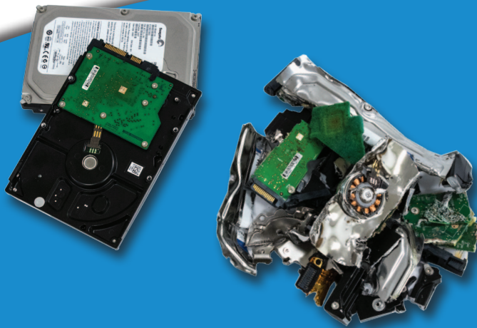
3.5" HDD Hard Drives Shredded with the FD 87HDS-R