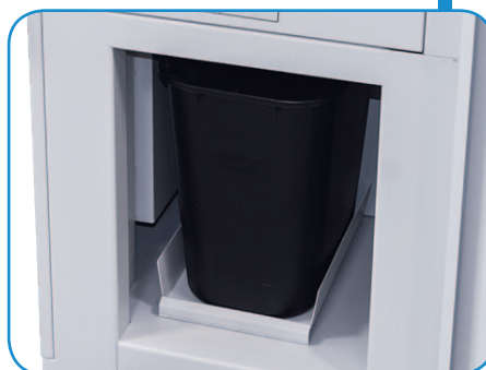
Rugged molded plastic waste bin for convenient storage and disposal