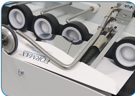
Precision moistening roller and flap closing bar accurately seal stacked or nested envelopes in a single pass