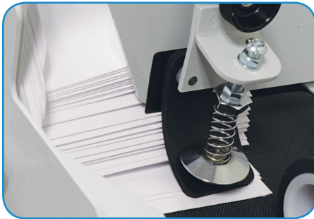
Envelope separator ensures single feeding

Options: FD 430-10 Extended Sealing Kit for flaps up to 4" long, FD 430-20 Square Flap Moistening Basin and Roller