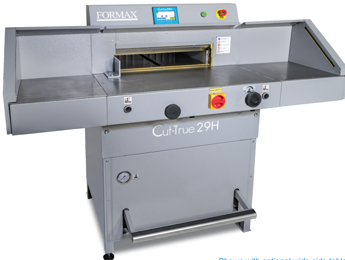
Shown with optional wide side tables

The Formax Cut-True 29H Hydraulic Guillotine Paper Cutter offers precision cutting for paper stacks up to 20.5" wide. User-friendly, intuitive features include a touchscreen control panel, automatically-adjusting back gauge and the capacity to program up to 100 jobs/100 cuts . An infrared light beam safety curtain provides safety and convenience as it shuts down operation if the light plane is interrupted.