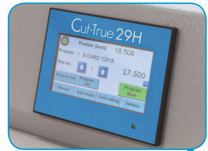
Touchscreen control panel allows for programming up to 100 jobs