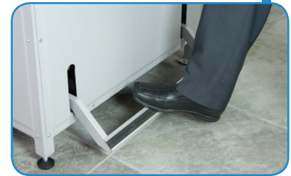
Foot pedal pre-clamp holds paper to check alignment prior to cutting