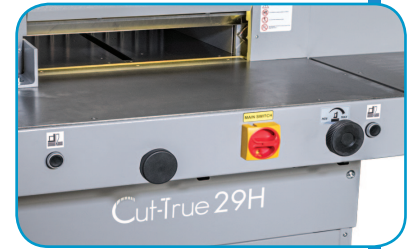
Two-button operation, fine-tune knob, adjustable hydraulic pressure