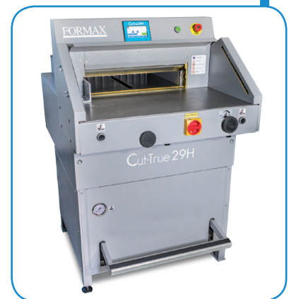
Standard model, without side tables