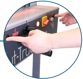
Two-Hand Operation Safely engages clamp and blade, keeping hands away from the cutting area