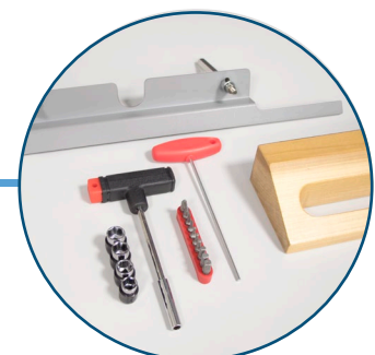
Blade Change Safety Tool Kit Change blades safely and easily, and make adjustments