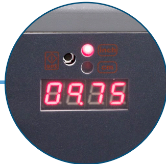
LED Back Gauge Display Get a precise cut using standard or metric settings