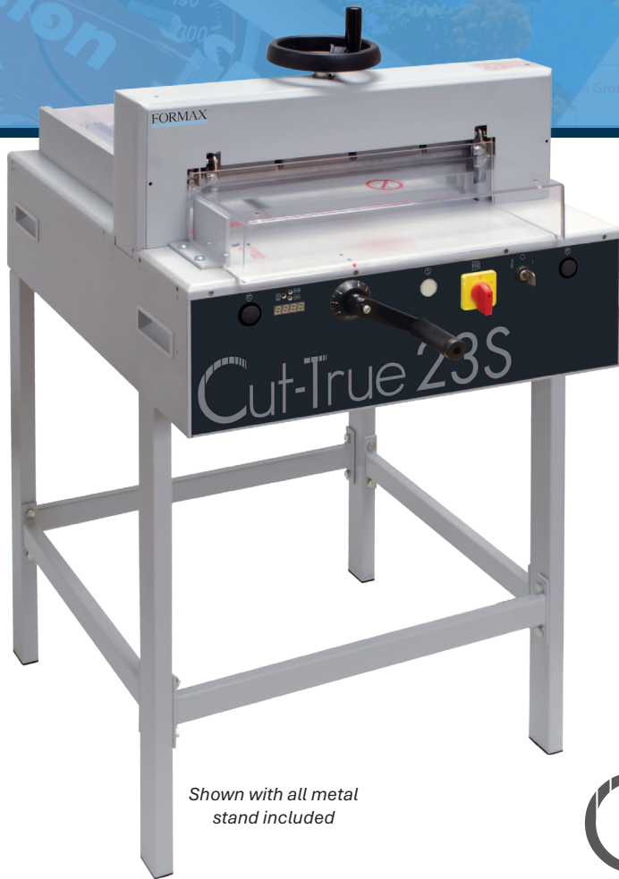
Shown with all metal stand included