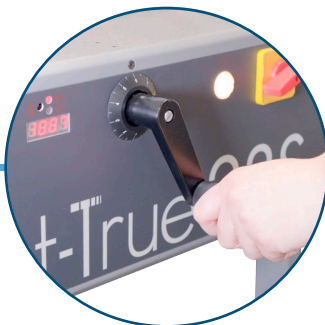
Manual Back Gauge Adjustment Fine-tune control for precision cutting