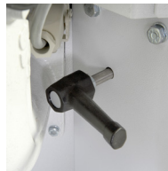
UP-AIR ADJUSTMENT LEVER