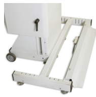
ADJUSTABLE PEDALS & HEIGHT