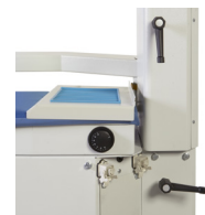
AIR FLOW ADJUSTMENT