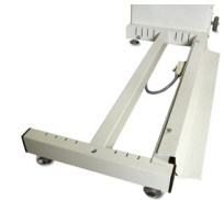
2-POSITION ADJUSTABLE PEDALS