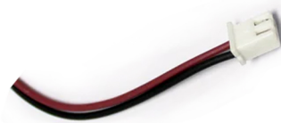
2 Pin JST XH Female Cable (2.54mm Pitch)