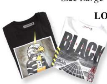
BLACK PYRAMID GRAPHIC TEES $60 / Now $30 (Black) Size Medium (White) Size Small