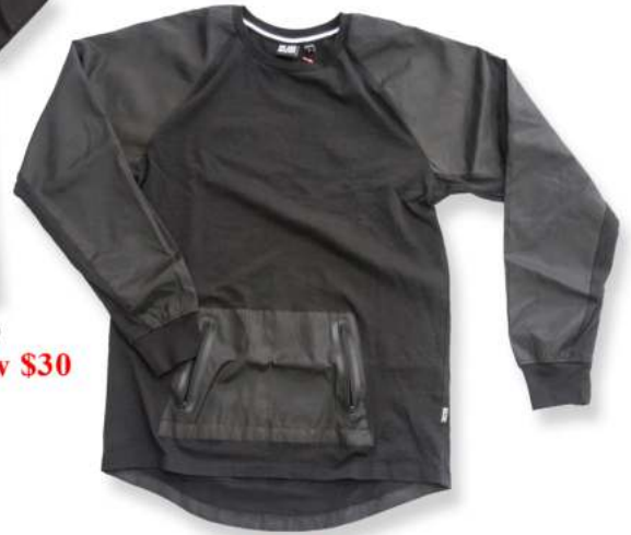
MASSIV CLYDE RIPSTOP LONG SLEEVE $60 / Now $30 Size Large