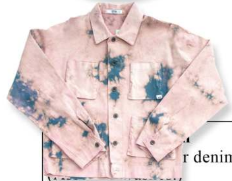
EPTM GUNNINGHAM JACKET $80 / Now $40 SIZES 30-40 AVAILABLE Sizes S-3XL