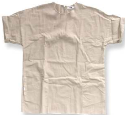
EPTM FRAYED WOVEN TEE $60 / Now $30 Size Large