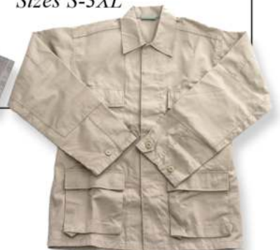
ROTHCO BDU SHIRT $50/ Now $25 Size Small & X-Large