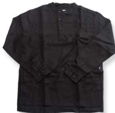
PUBLISH ISAAC BUTTON UP $90 / Now $45 Size X-Large