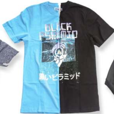
BLACK PYRAMID MATRIX TEE $60 / Now $30 (Blue) Sizes S-XL (Black) Sizes M-2XL