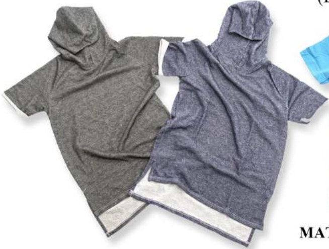
IMPRSSVE REZORS HOODIES $60 / Now $30 Size Small