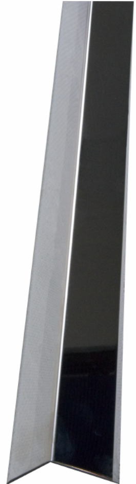
X-L Buff Stainless Steel