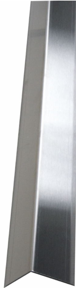
#4 Brush Stainless Steel