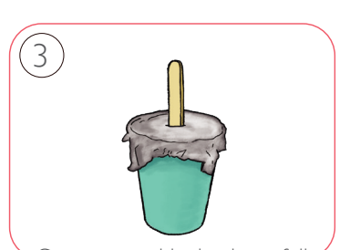
Cover tops with aluminum foil. Poke a hole in the center and insert a popsicle stick.