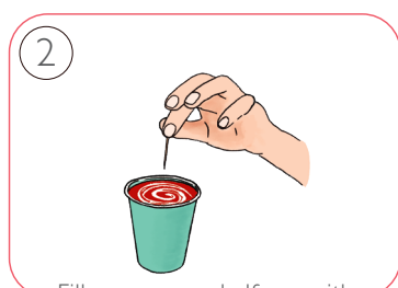
Fill paper cups halfway with / yogurt. Top with pureed strawberries. Use a toothpick to swirl.