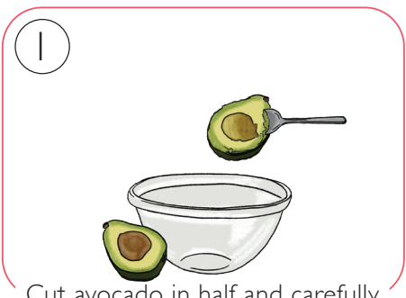
Cut avocado in half and carefully remove pit. Scoop out flesh and add to medium bowl.