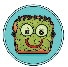
Yield: 2 servings

Prepare spooky avocado toast to look like Frankenstein's monster!