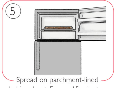
baking sheet. Freeze 15 minutes, until chocolate is set.

Add rice cereal and chocolate mixture to large bowl. Stir until coated. Cool 5 minutes.