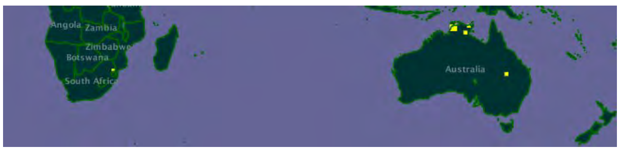
Figure 1 (above). Global distribution of C. quadricarinatus. Map from GBIF (2010).