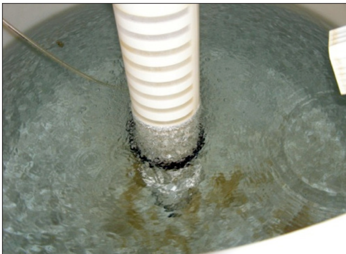
Figure 7. Newly hatched fry held in circular tanks.

Time to hatching varies with water temperature and egg age at the time of collection. Eggs hatch quickly at 68 °F (20 °C), within 2 to 4 days. Hatching rates of 75 to 80 percent have been obtained when eggs are treated to control fungus. Fry leaving the hatching jar are collected in a holding tank (Fig. 7). The tank drain is covered with a fine-mesh screen to retain fry. Aeration is provided through a flexible air stone or perforated hose wrapped around the drain screen; this also helps reduce clogging and fry impingement.