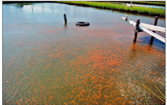
Figure 1. Intensive outdoor production of rosy red fathead minnows produced from indoor hatching.

Fathead minnows are traditionally produced using the spawning-rearing pond method, where 500 to 2,000 brood fish per acre (1,200 to 5,000/ha) are stocked into