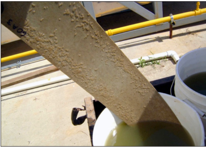
Figure 2. Eggs lining the edges of 6-inch-wide (15-cm-wide) conveyor belt material.