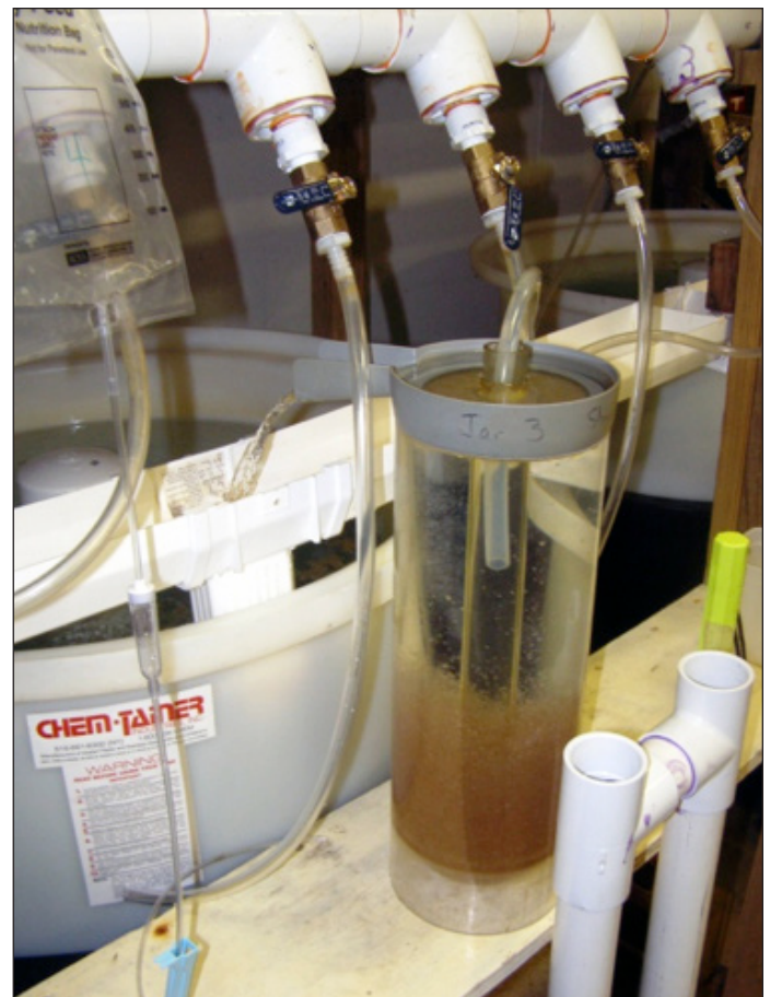
Figure 6. Fathead minnow eggs are incubated in McDonald jars. At hatching, fry move with the water flow into circular tanks. The plastic bag (upper left) was used to drip in a chemical solution for fungus treatments over time.

Fathead minnow eggs can be incubated in hatching jars (e.g., McDonald jars) in the same manner as other fish eggs (Fig. 6). Egg numbers may be estimated volumetrically by using a graduated cylinder to determine total egg volume and then counting several small sub-samples. Egg counts per milliliter (mL) are generally in the range of 470 to 580; assuming 500 eggs per mL provides a conservative estimate for planning purposes. The water flow should be adjusted so that the eggs roll freely (e.g., 0.6 to 0.7 gpm or 2.3 to 2.6 Lpm), but vigorous movement should be avoided as it can reduce hatch. Conceivably, eggs could be left attached to substrate for indoor incubation. However, this would require relatively large tanks to hold the substrates, and fungus treatment would be more complex and