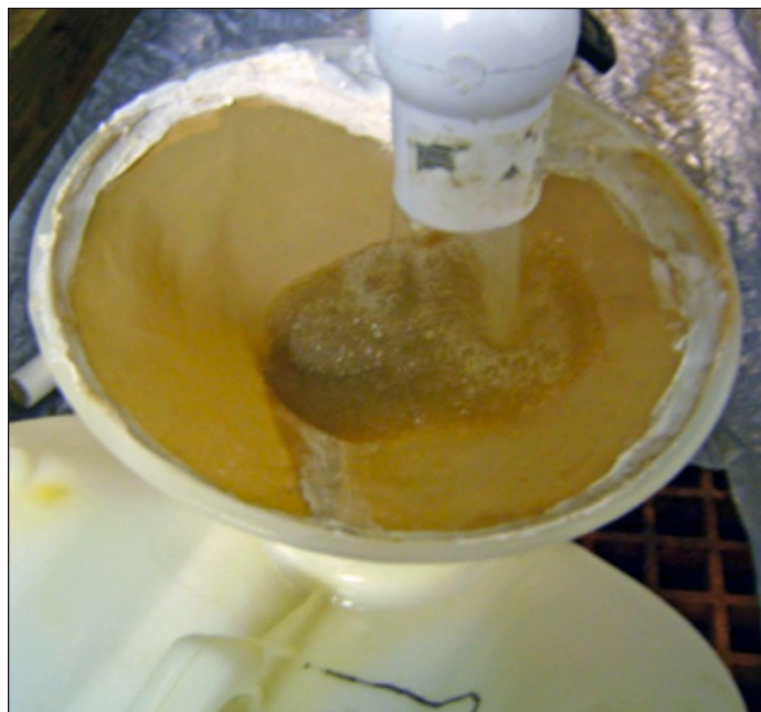
Figure 5. Eggs are removed with 1.5 percent sodium sulfite solution and collected in a screened funnel.

Eggs can be removed from substrate using a bath of 1.5 percent sodium sulfite solution. Soaking eggs in the solution for a minute or so is helpful. Unlike golden shiner eggs, which fall off almost immediately, fathead minnow eggs require more time and gentle agitation of the substrate to loosen them. Some eggs will remain attached, but can be washed off with a gentle stream of the solution. The sodium sulfite solution has no oxygen, so eggs should not be left in the solution any longer than necessary. One study found that eggs could be left in the solution for up to 30 minutes without apparent harm. Loose eggs fall to the tank bottom. Using a conical tank