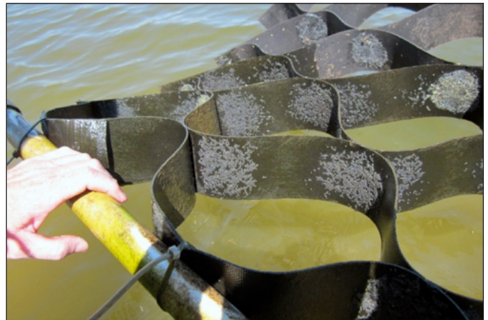
Figure 4. Up to three nests were found within a cell of the geoweb material.