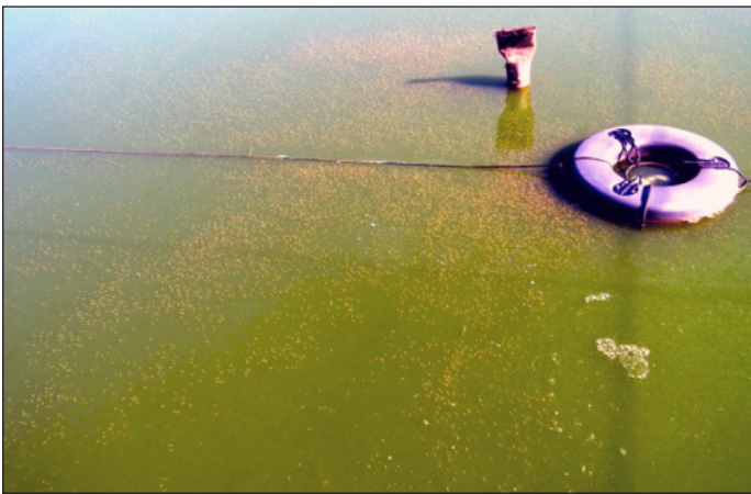
Figure 9. One-month-old rosy red fathead minnows feeding at the surface (about 1.4 million fish per acre or 3.5 million per hectare).

There is limited information on appropriate stocking rates for fry. Previous work on the stocking of golden shiner fry from hatcheries found that survival rates in commercial ponds were similar to those in experimental ponds. If this holds true for fathead minnows as well, fry for the feeder market can be stocked at 1 to 2 million per acre (2.5 to 5 million/ha) with good survival and high yields. To produce bait minnows, lower fry densities are indicated, about 300,000 to 500,000 per acre (740,000 to 1.2 million/ha). However, if the density is too low, fish will mature and might begin to spawn at 3 to 4 months of age.