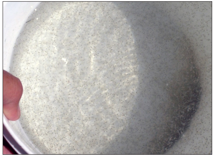
Figure 8. Fathead minnow fry concentrated prior to stocking.

Fry numbers can be estimated with the same techniques used for other species that have tiny fry. Fry are too small and delicate to be collected in a dip net and weighed. The volumetric method is simple but time-consuming. Fry are retained in a tank with a known water volume, the water is gently stirred to evenly distribute the fry, and three or more subsamples are collected from the