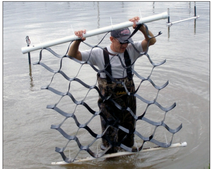
Figure 3. Sections of plastic geoweb used as spawning substrate. Plastic pipe was used as a float, and a small diameter pipe filled with sand served as a weight.

Substrate should be durable, easily cleaned between spawns, and easy to manipulate during the egg removal process. A textured or rough substrate is essential for good egg retention. Research has shown that less than half the eggs laid will stick on smooth substrates, while rough or textured substrates retain the majority of eggs. In tests, 6-inch-wide (15-cm-wide) conveyor belt material worked well for egg collection, as the belts were easily coiled for transport and egg removal (Fig. 2). Plastic geoweb material (used for slope stabilization) has also worked well as spawning substrate. The geoweb tested consisted of 3-inch-wide (7.6-cm-wide), textured, high-density plastic strips welded together to form a series of cells (EnviroGrid EGA 203T-29, textured, not perforated; available from vendors such as Geo Products and U.S. Fabrics). This material was selected because the textured surface retains eggs and because the narrow width and cellular form suit fathead minnow biology—fatheads appear to prefer to nest near the edges of substrates and also near each other, in colonies. Each cell provides 39 square inches (252 cm 2 ) of overhead substrate. A single geoweb panel opens up to 8.4 feet (2.56 m) deep and 21.4 feet (6.52 m) long and costs about $200, including delivery (2012). In tests, a panel was cut into short strips, each zip-tied to a plastic pipe float at the top and a weighted pipe at the bottom (small diameter pipe filled with sand and capped) (Figs. 3 and 4).