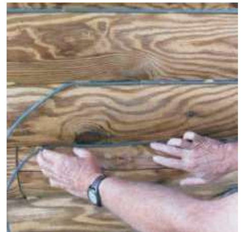
Attaching backer rod

If you are going to be applying Lifeline Advance™ Topcoat, apply the topcoat after the Energy Seal. This results in a more even appearance to the sealed areas and helps them blend in with the rest of the wall. Furthermore, it helps keep the Energy Seal application clean and easier to clean when maintenance cleaning is required.