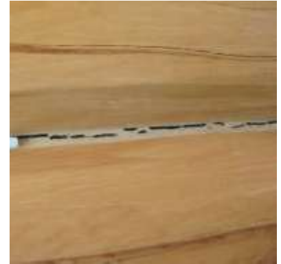
Sealant applied to a narrow seam without backing material