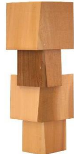
Flush 135 Corners (for Bay Windows)