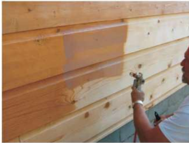
Spray/Apply finish to a small area