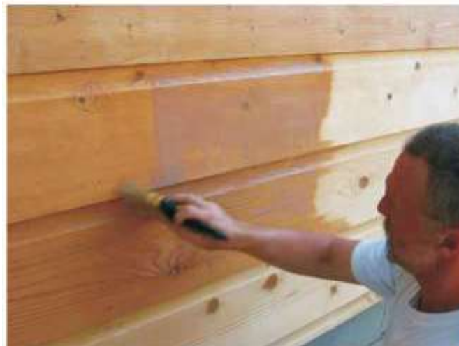
Back-brush finish to obtain a uniform film