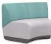
120° Inner Seat