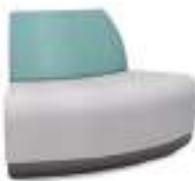
120° Outer Seat