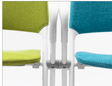
Intuitive interlocking system