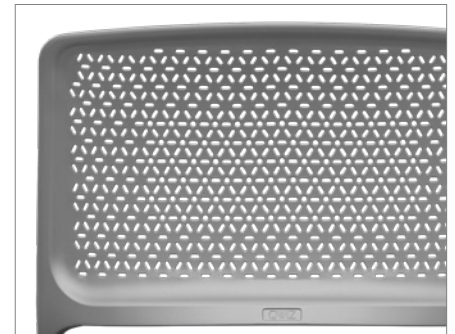
Maximum breathability + comfort