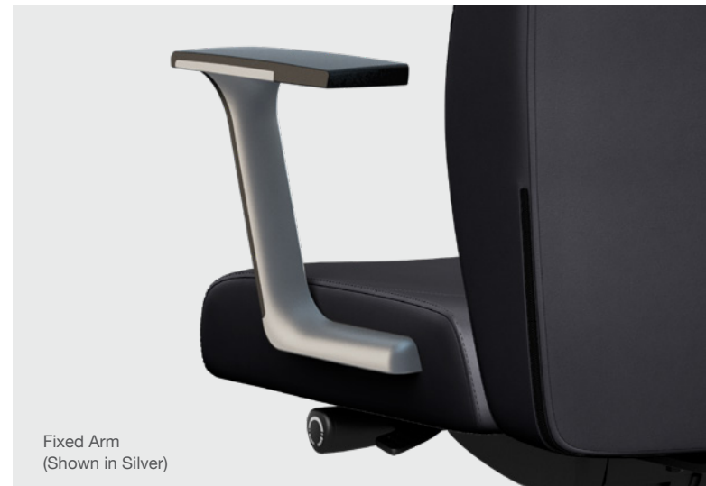
Fixed Arm (Shown in Silver)