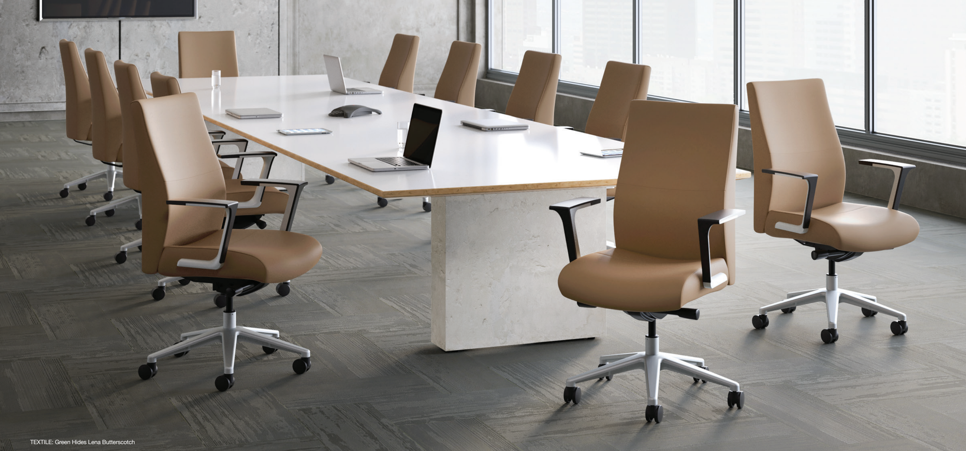
TEXTILE: Green Hides Lena Butterscotch