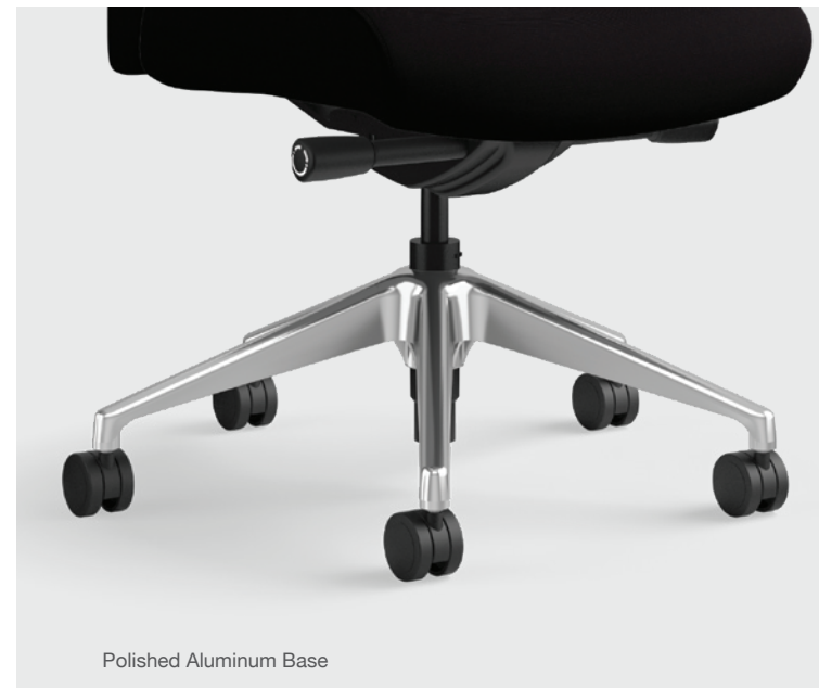
Polished Aluminum Base