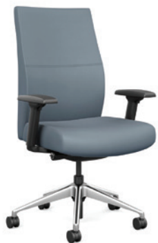
MIDBACK TEXTILE: SitOnIt Seating/IDEON Sili-Tex Original Thunder