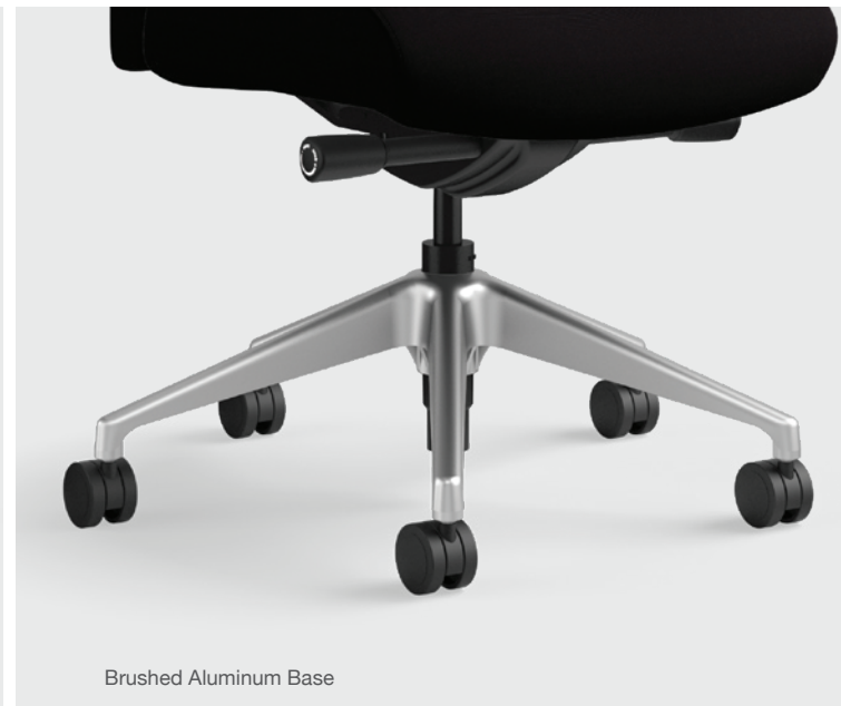
Brushed Aluminum Base