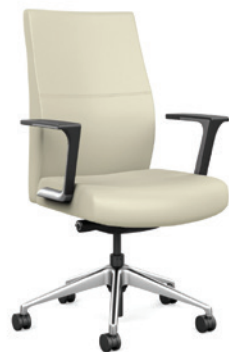
MIDBACK TEXTILE: Maharam Lariat Ivory