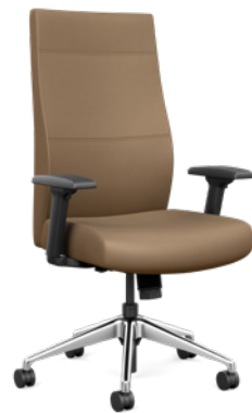
HIGHBACK TEXTILE: SitOnIt Slide Desert