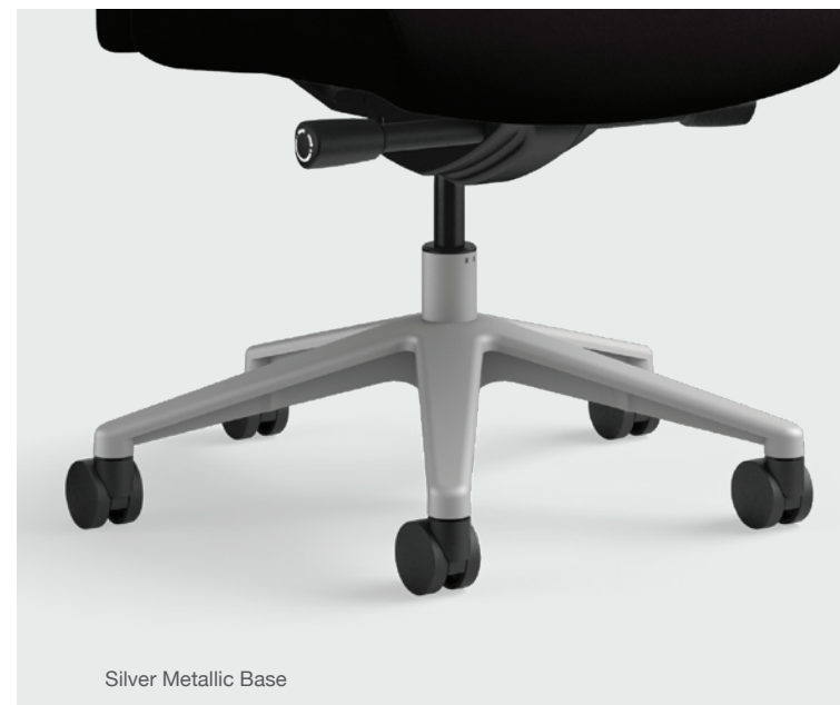
Silver Metallic Base