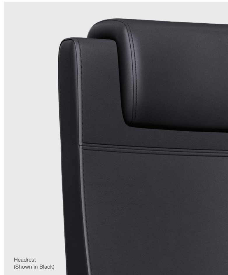
Headrest (Shown in Black)

Our Prava's mixed-media arm bears Pensi's signature cast-aluminum design—the contemporary fusion of aluminum and plastic adds a subtly modern touch to any room.