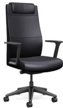
HIGHBACK (WITH HEADREST) TEXTILE: CF Stinson Laredo Onyx