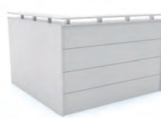
Corner Reception with Top