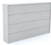
Straight Reception without Top