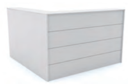
Corner Reception without Top