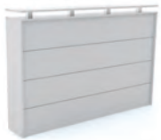
Straight Reception with Top