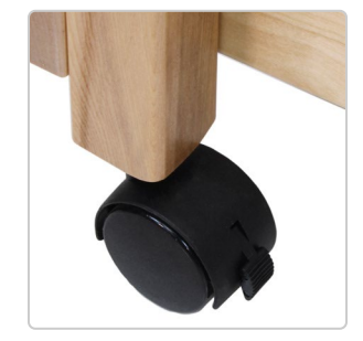
2" lockable casters