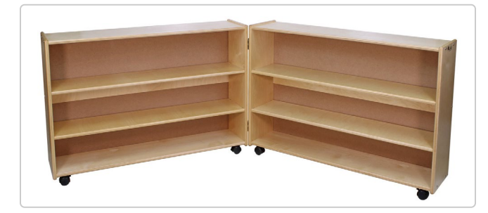
Hinged Units are also available (S350/9 Data Sheet)