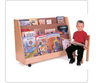
S320 includes a rear shelf