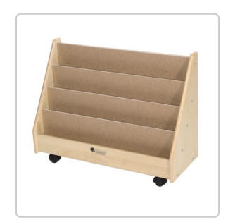
S326 Preschool Rack