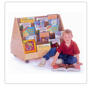
S323 is double-sided