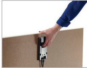
Our easy Flip/Folding Mechanism can be activated with one hand.