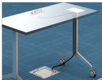
Optional Wire Manager conceals and routes power and data from the table top to the floor.