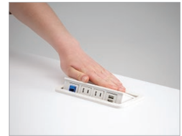
Optional "pop-up" power/data access. Available in Black, White and Aluminum.