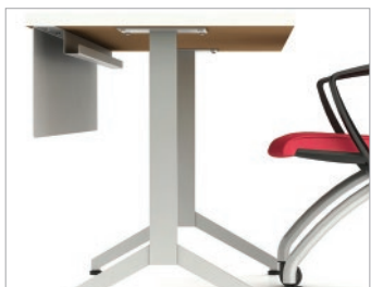
Optional Cable Management Modesty neatly conceals power/data cables for Fixed Top Tables.