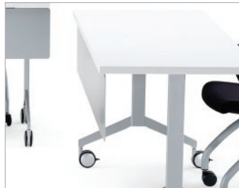
Multiple Modesty options available.