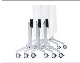
Flip and nest snugly when not in use.