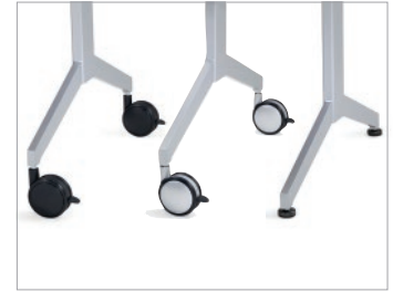
Choose from Black Casters, Two-Tone Casters or Glides. Y Base shown.