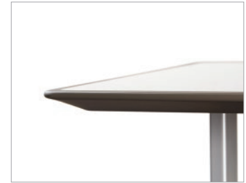
Urethane Knife Edge is offered in Trendway standard trim colors (except Designer White).