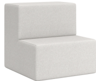
Kae 2 - Tier KAE2