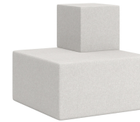
Kae Outside Corner KAE2OC