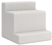
Kae 3 - Tier KAE3

The Kae Collection is covered under Flexxform's Lifetime Warranty Guarantee. For more information visit www.flexxform.co/warranty