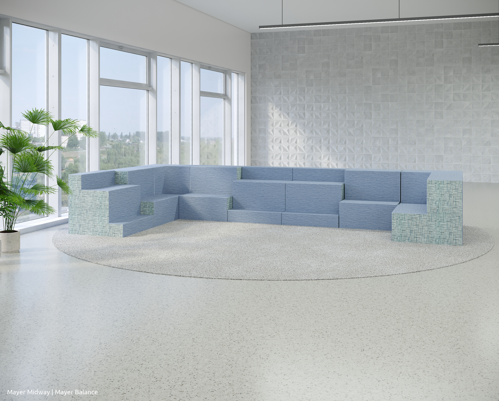
Mayer Midway | Mayer Balance