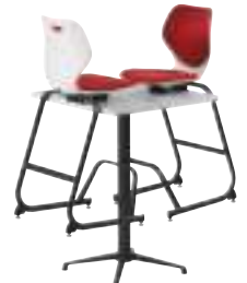
Stacked on table