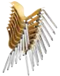
Stacked on floor