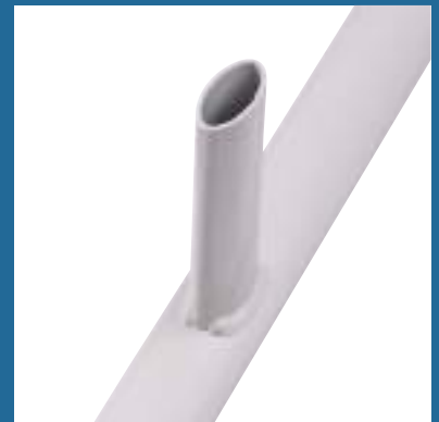
Elliptical tubing depth dimension is twice as thick as round tubing and more dent resistant. Exceeds ANSI/ BIFMA tests for back strength, back durability, seating drop, seating impact, leg strength and tablet arm load.