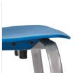
Waterfall seat front adds comfort and minimizes leg pressure