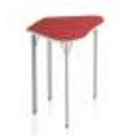
29" fixed height W32 D20.5 H29