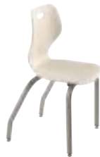
19" W19.75 D21.25 H34.5 Seat: W17.5 D17 H19