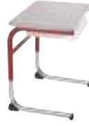
Adjustable W26 D19 H24-30