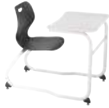
Large W26 D36.75 H32 Seat: W17.5 D17 H18 Belly Room: 16