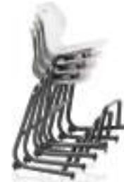
Stacked on floor

W20.25 D21.75 H38.5 Seat: W17.5 D17 H24.5