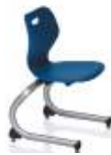
15" W17.25 D17 H26.5 Seat: W14.25 D14 H15