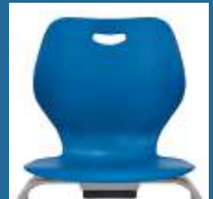
Wider back provides greater support