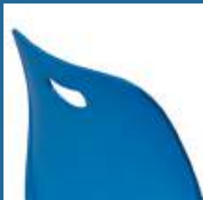
Integral handle enables easy movement