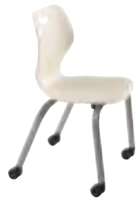
18" W19.75 D20.5 H32 Seat: W17.5 D17 H18