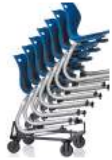
Stacked on dolly