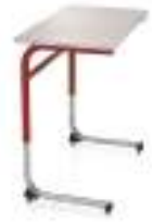
ADA W36 D20 H28-34