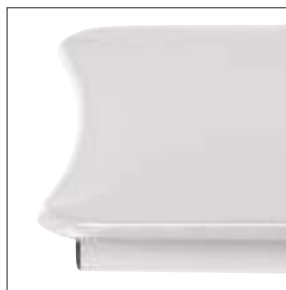
Curved desk edge provides increased belly room