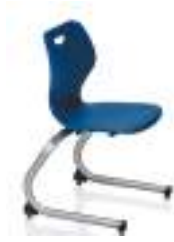
18" W20.25 D20.5 H32 Seat: W17.5 D17 H18