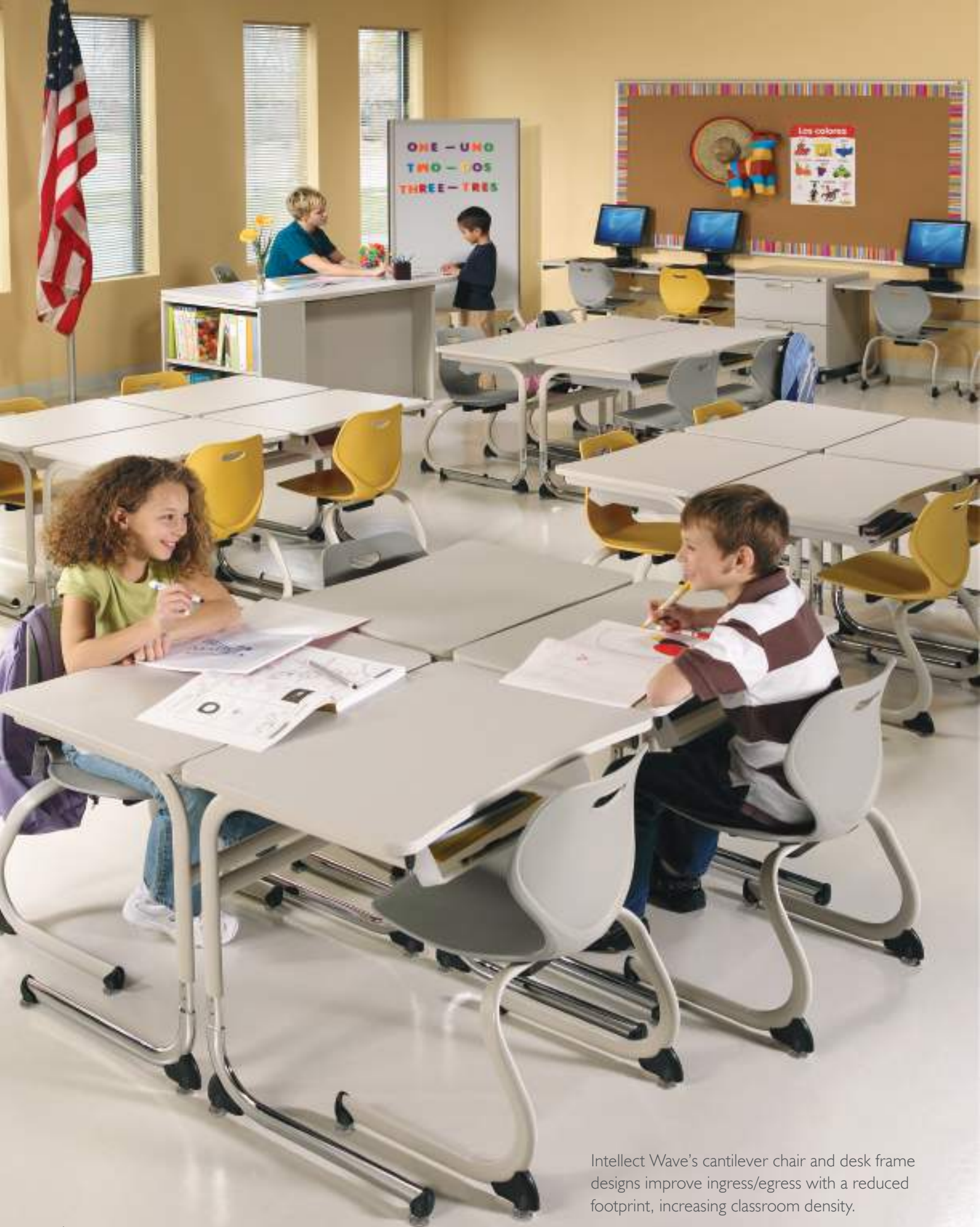
Intellect Wave's cantilever chair and desk frame designs improve ingress/egress with a reduced footprint, increasing classroom density.