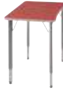
Adjustable W26 D19 H22-34