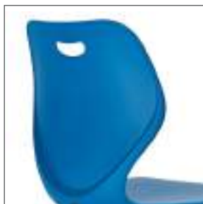
Smooth ribless back is easy to clean