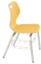
18" W19.75 D20.5 H32 Seat: W17.5 D17 H18