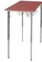
ADA W36 D20 H22-34