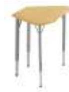
Adjustable W32 D20.5 H22-34