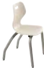
16.5" W16.75 D17.5 H29.25 Seat: W14.25 D14 H16.5