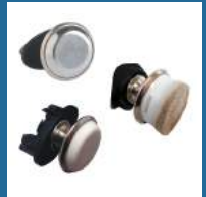
Steel, felt capped and nylon glides.