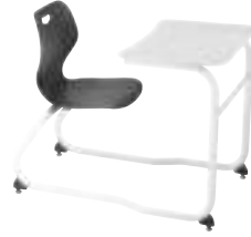
Extra Large W26 D38.25 H32 Seat: W17.5 D17 H18 Belly Room: 17.5