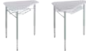
Linear W23.5 D36.5 H22-34