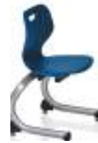
13" W15.5 D14.25 H23 Seat: W12.5 D12 H13.75