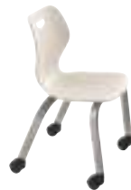
15" W16.75 D17 H26.5 Seat: W14.25 D14 H15