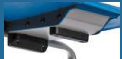
Stacking bumpers prevent damage to other chairs and worksurfaces.