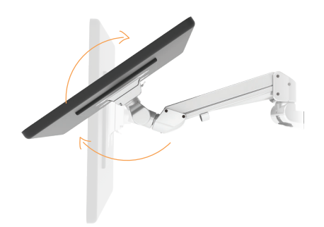
VESA mounts tilt up and down, providing a flat writing surface for touch screen monitors.