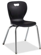
Explorer 18" 4-Leg Chair