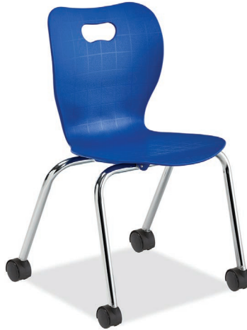
Smooth Caster Chair