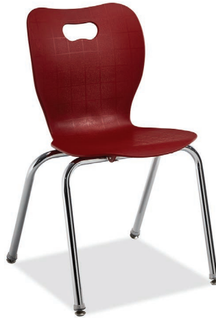
Shown with optional Chrome Frame