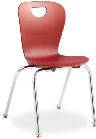
Shown with optional Chrome Frame