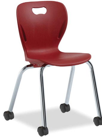
Shown with optional Chrome Frame