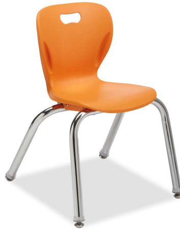
Shown with optional Chrome Frame