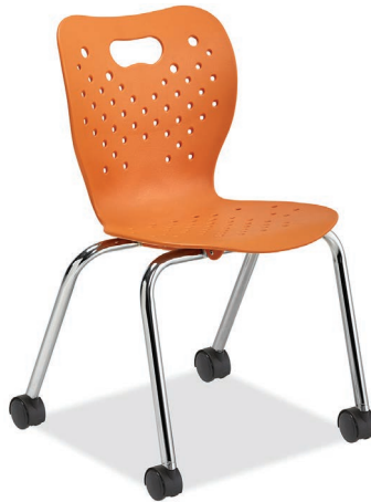
Air Caster Chair