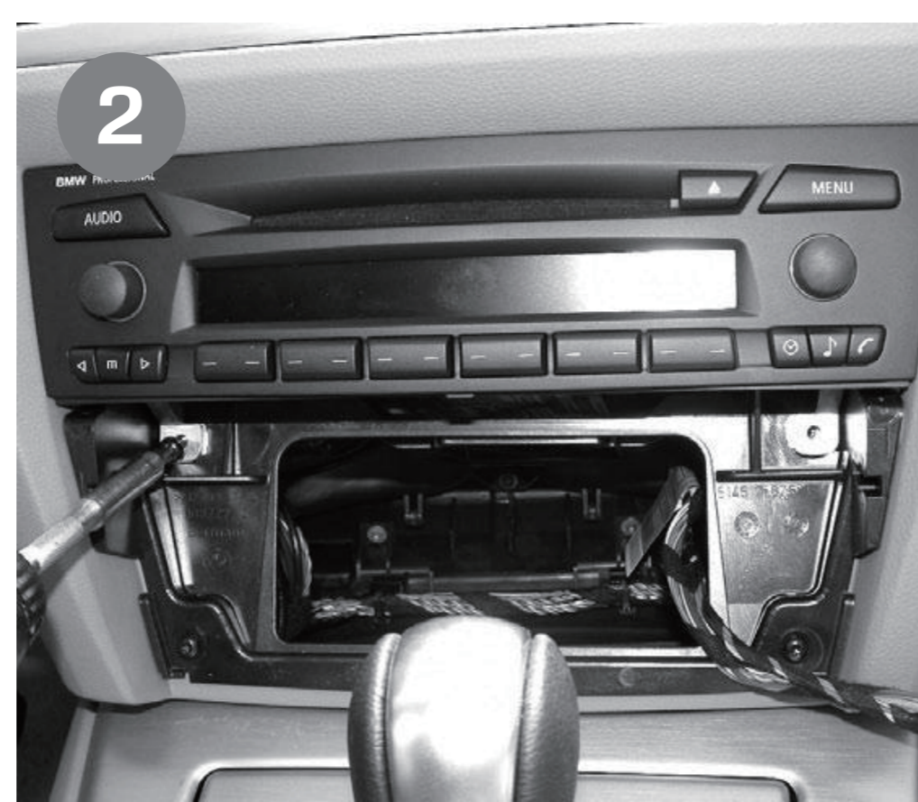
Remove two Phillips screws from the bottom of the radio and remove.