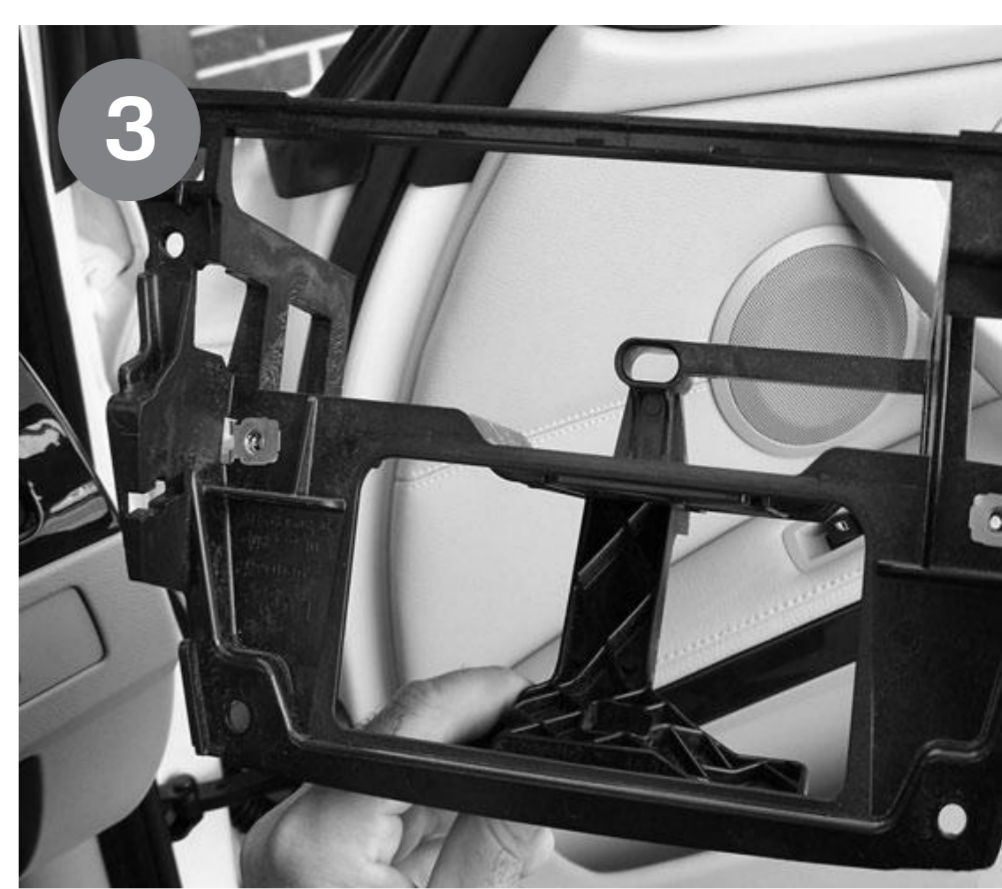
Remove the four Torx screws from the sub-dash bracket and remove