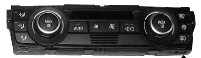
Remove the climate control and the center console switch unit from the climate control bezel.