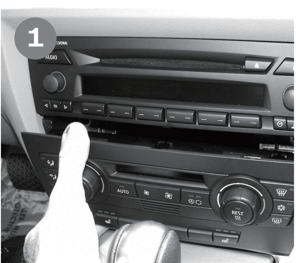
Carefully unclip and remove the climate controls.