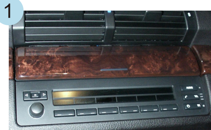
Remove the original.