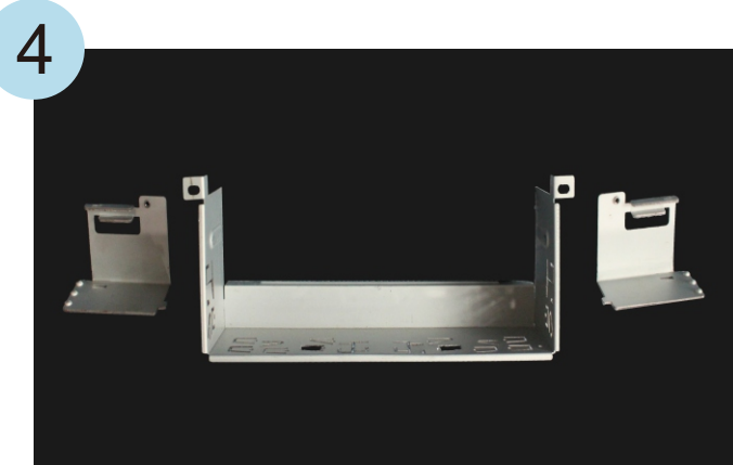
The metal part be need.