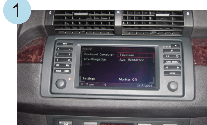
Remove the original On-board monitor.