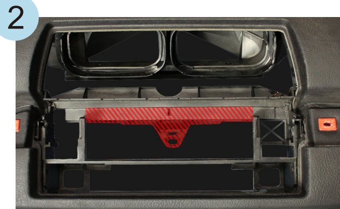
Cut the plastic part as marked in the picture.