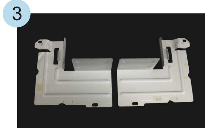
The metal part be need.