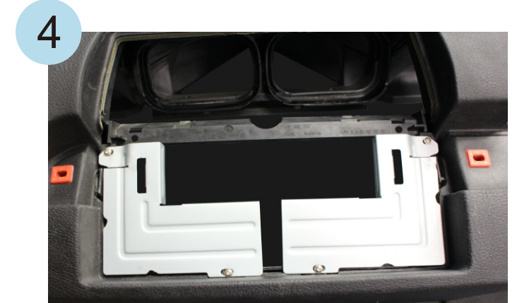
Put in and fix the metal part in the car.