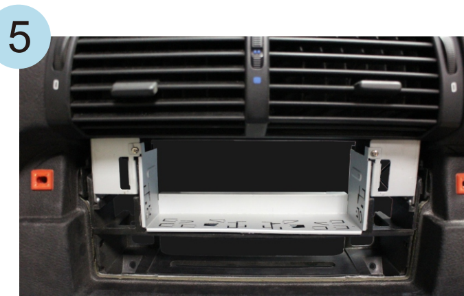
Put in and fix the metal part in the car.