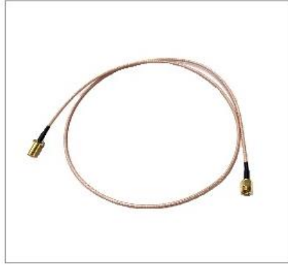
BT WiFi Antenna Extension Cable