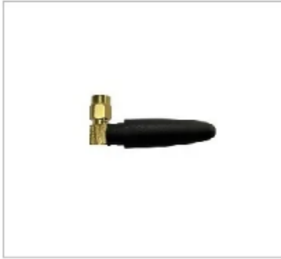
BT WiFi Antenna

Lastly, make sure your firmware is up to date .