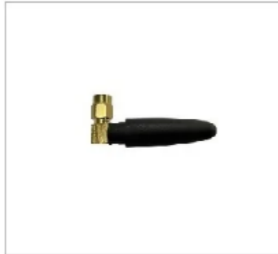
BT WiFi Antenna

If Bluetooth is not connecting, make sure you have the included Bluetooth WiFi antenna connected to the “WIFI BT” connection on the back of the Dynavin.