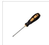
Cable pulling tool