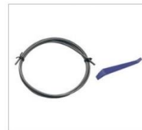
Trim removal tool and fish tape for running cables/wires