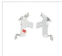
Metal mounting brackets