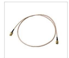
BT/WiFi Antenna Extension