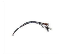
Camera RCA Harness (for factory and aftermarket cameras)