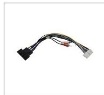
Main Wire Harness