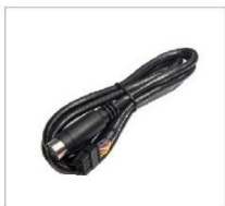
SiriusXM Adapter Cable for SXV300 Tuner only