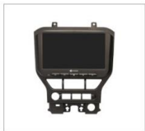
LCD Display Screen