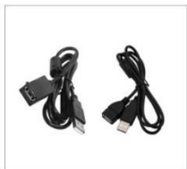
USB 3' Extension Cables "Phone" & "Media"