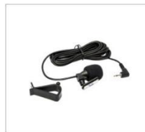
Microphone (for BT calling and voice commands)