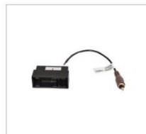
Factory Camera Adapter A and Factory Camera Adapter B (use the one that fits AND works)