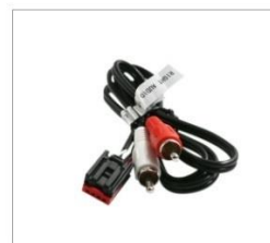
Adapter for factory AUX connection