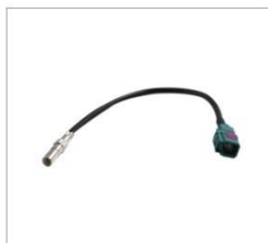
Factory AM/FM radio antenna adapter