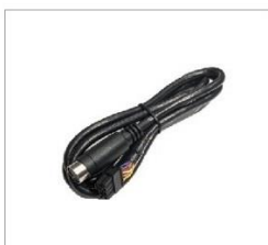
SiriusXM Adapter Cable for SXV300 Tuner only