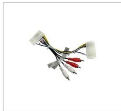
Amplifier Retention Harness (not used with base models, sometimes used with Shaker models)