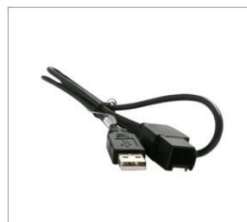
Adapter for factory USB connections