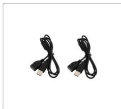
USB extension cables (2)