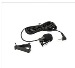
Microphone (for BT calling and voice commands)