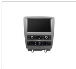
LCD Display assembly