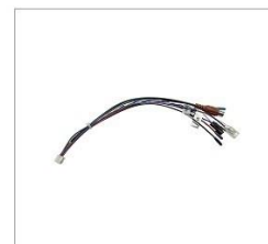
Camera RCA Harness