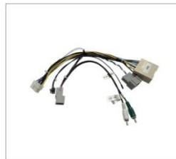
Main Wire Harness "9000"