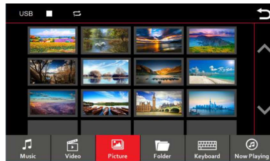
Image View Menu