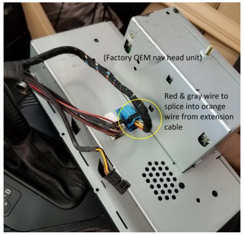
(BMW E39 w/ OEM nav pictured above; varies by model)

The orange illumination wire on the extension cable needs to be connected to one of the car's illumination wires which are in the dash (unplugged from the OEM radio). You will need to splice the orange wire from the extension "Fakra" cable into a dash lighting circuit. The easiest place to do this on most cars is the ashtray light or at the stock head unit plug; in most BMWs the lighting wire is the red and gray wire on the blue plug (pictured below). ALWAYS confirm this with a test light or voltmeter.