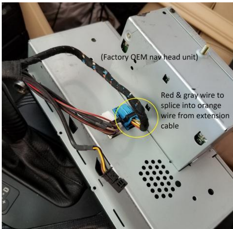
(BMW E39 w/ OEM nav pictured above; varies by model)

The orange illumination wire on the extension cable needs to be connected to one of the car's illumination wires which are in the dash (unplugged from the OEM radio). You will need to splice the orange wire from the extension "Fakra" cable into a dash lighting circuit. The easiest place to do this on most cars is the ashtray light or at the stock head unit plug; in most BMWs the lighting wire is the red and gray wire on the blue plug (pictured below). ALWAYS confirm this with a test light or voltmeter.