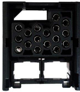
17 Pin Connector (round pins)