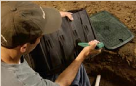
Knock-outs are easily removed.