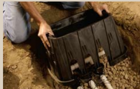
Reattach the knock-outs to keep out backfill dirt.