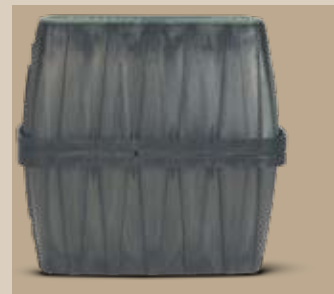
Interlock two valve boxes for deeper installations.