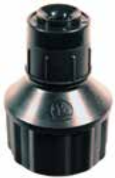
Spectrum™ Thread 1/2"