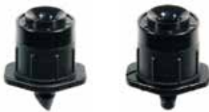
Spectrum™ Barb 4 mm