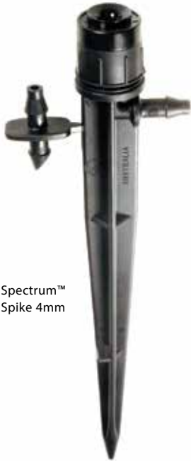
Spectrum™ Spike 4mm