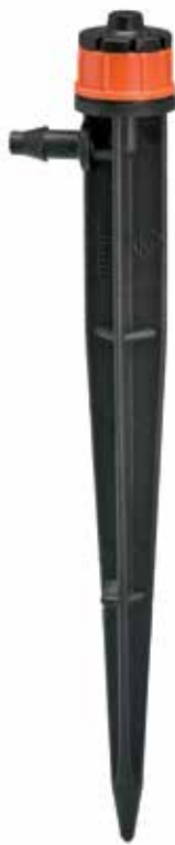
Shrubbler® 360° PC Spike 4 mm