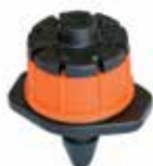
Shrubbler® 360° PC Barb 4 mm