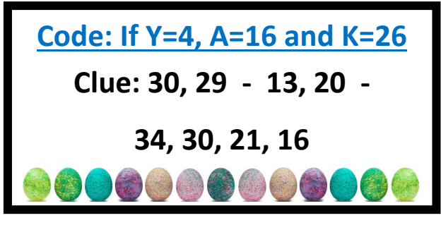
Clue 1 - on the sofa

Pick the six clues that are best suited to where you can hide the egg cards in the place where you are doing the Easter Egg Hunt. Cut out these clues and then hide the eggs in those locations, and you are ready to go. Don't forget they will need the code wheel to solve the clues.