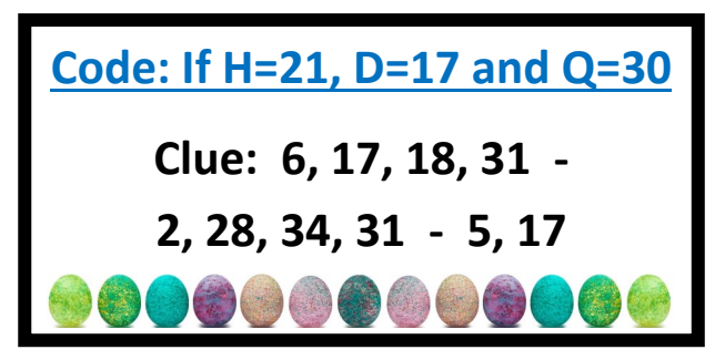
Clue 2 - under your bed