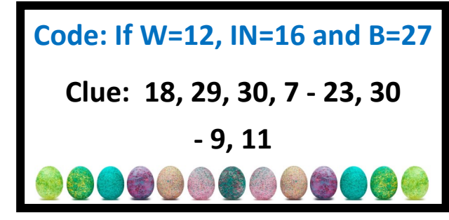
Clue 4 - under the tv