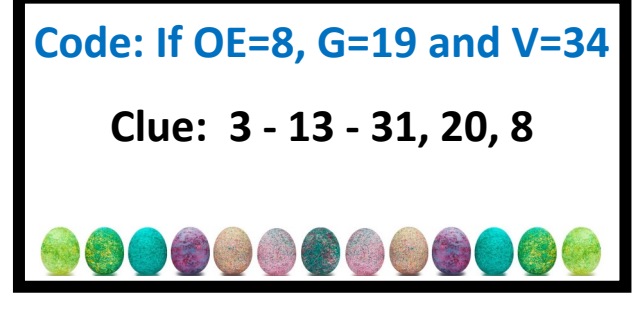
Clue 9 - in a shoe