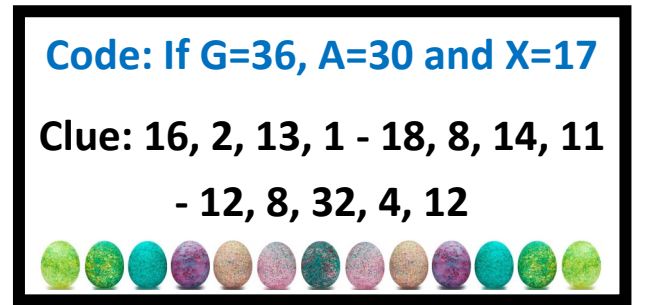
Clue 5 - with your socks