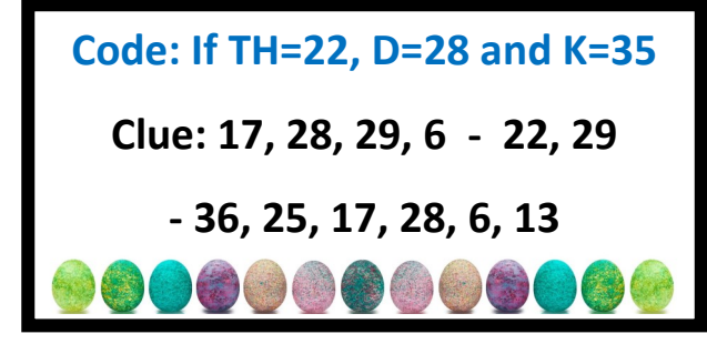
Clue 6 - under the laundry