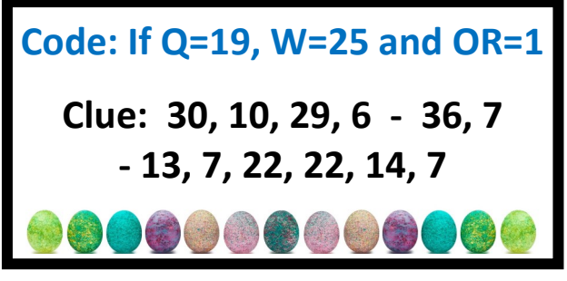
Clue 7 - behind the kettle