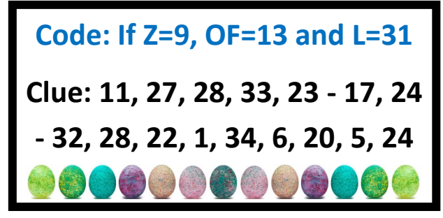
Clue 3 - behind the microwave