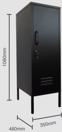
1080H MINI LOCKER