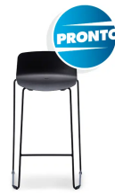
Unica Mini PP Stool 'Pronto'