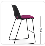
640mm Seat Height