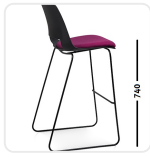
740mm Seat Height